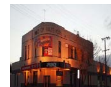
Prince of Wales Hotel Port Road Queenstown 8447 1252

SLUM DOGS Bulldogs Past supporting Bulldogs Present